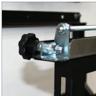
Screen position control on all 4 corners