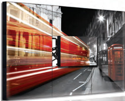
Example 3x3 Landscape